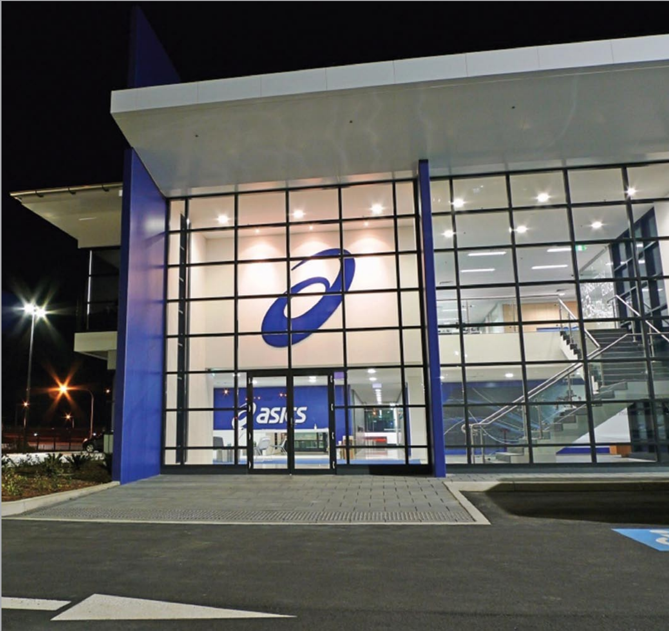
ASICS: Eastern Creek, Sydney