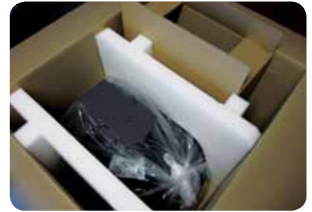
A new packaging solution