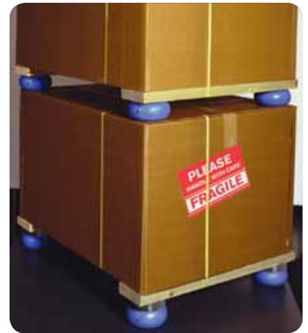
Improved transport handling