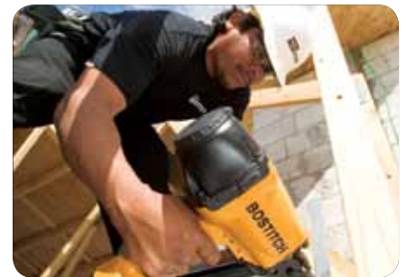
Improved factory floor safety

managers; they are taking safety very seriously and now own it as an issue" Peter said.